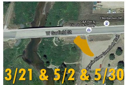
Optimist Park - Main Parking Lot