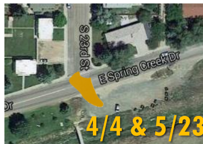
La Prele Park - Parking Lot at 23 rd & Spring Creek