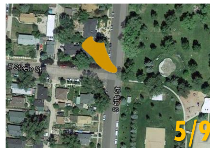
Undine Park - 5 th & Steele