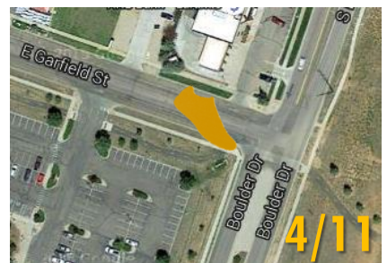
Rec Center - corner of Garfield & Boulder