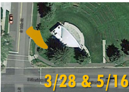
Washington Park - Band Stand at 18 th & Sheridan