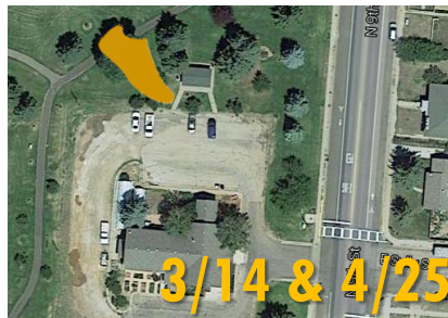
La Bonte Park - Pavilion at 9 th & Sully